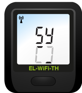
5) DATA SYNCING