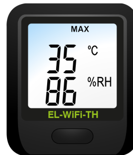
2) MAXIMUM RECORDED VALUES SINCE LAST RESET