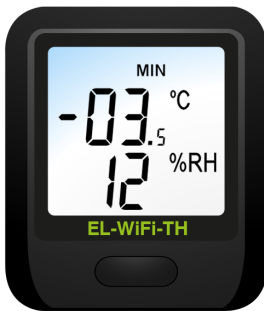
3) MINIMUM RECORDED VALUES SINCE LAST RESET