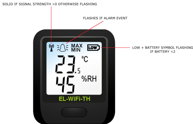
1) NORMAL DISPLAY - CURRENT TEMPERATURE